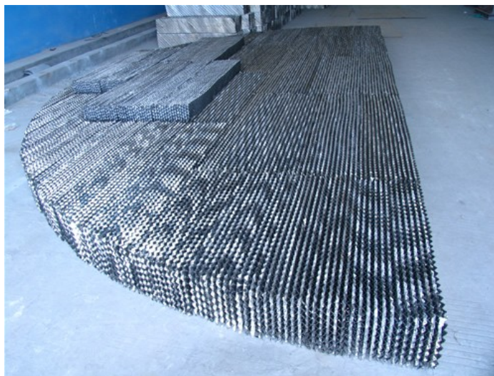
Illustration 1: Metal Structured Packing(KPK-MSP)

CHEMPACK Metal Structured Packing include perforated & corrugated plate, corrugated plate gauze, pricked & corrugated plate, corrugated wire gauze and ,annular corrugated plate.