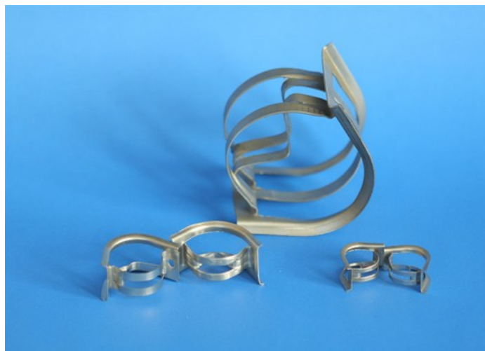
Illustration 4: Metal Intalox Saddle Ring(KPK-MIS)

CHEMPACK Metal Intalox Saddle Ring is high performance random packing successfully used in mass transfer towers both small and large diameter. It is frequently used in deep vacuum towers where low pressure drop is crucial and also high pressure towers where capacity significantly exceeds conventional trays. CHEMPACK Metal Intalox Saddle Ring or metal saddle is available in various sizes, which give different combinations of efficiency and pressure drop.