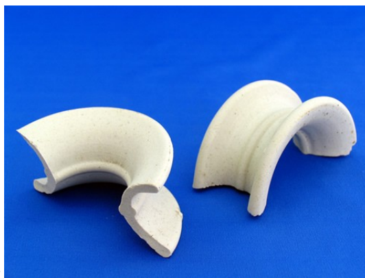
Illustration 2: Ceramic intalox saddle ring(KPK-CIS)

Ceramic Saddles are divided into two different types of products according to their properties, KPK-CIS-A is often used in the field of Chemical and Petrochemical industries, and KPK-CIS-B is mainly used in environmental areas such as RTO(Regenerative Thermal Oxidizers) equipment. But both of them are the most frequently used high-performance packing and exhibit advantages for most applications in comparison with other shapes. Their smooth surface imparts a high chemical resistance and provides Ceramic Intalox saddle rings (Ceramic Saddles) with a high level of stability. Due to their simple form, ceramic saddles can be produced at a relatively low cost.