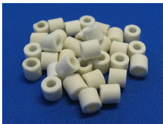
Illustration 5: Ceramic Raschig Ring(KPK-CRR) Small Size

Add: Pingxiang high and new technology industry park west zone, Pingxiang city, Jiangxi Pro., P.R.China Zipcode: 337000