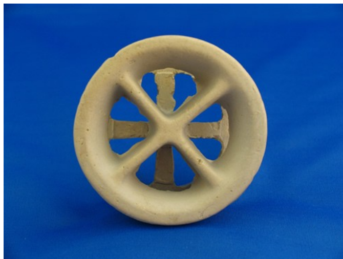
Illustration 6: Ceramic Cascade Ring(KPK-CCR)

Cascade ring absorbs advantages of short raschig ring and improves pall ring. Height diameter ratio of the ring is 1:2 and taper rolled edge is added to one end. It reduces resistance when the gas goes through the machine bed and increases flow rate. The intensity of the filling is quite high. Due to its structural characteristics, gas and liquid are distributed evenly and contact area of gas and liquid is increased, thus improving mass transfer efficiency.