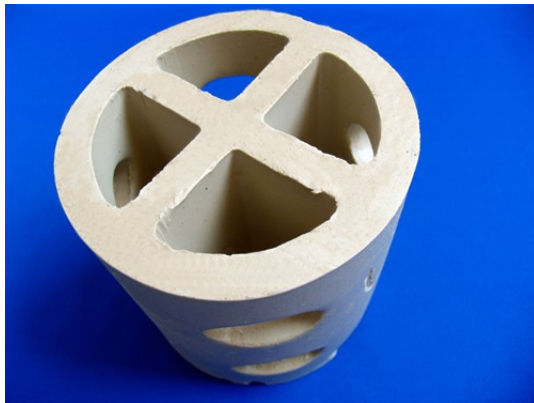
Illustration 7: Ceramic Cross Partition Ring(KPK-CCPR)