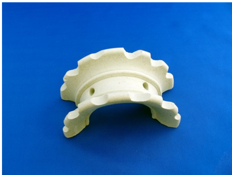
Illustration 3: Ceramic Super Saddle Ring(KPK-CSS)

CHEMPACK Ceramic Super Intalox saddles are the most frequently used high-performance packing which exhibit advantages for most applications in comparison with other packing of different shapes. Ceramic super saddles' smooth surface imparts a high chemical resistance and provides them with a high level of stability. Due to their simple form, CHEMPACK Ceramic Super Intalox saddles can be produced at a relatively low cost.