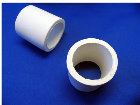
Illustration 4: Ceramic Raschig Ring(KPK-CRR) Large Size